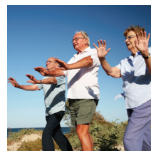
Beliefs and Attitudes